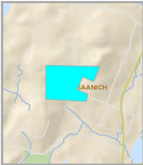
Property location within District of Saanich