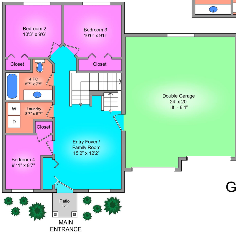
Ground Floor 1282 Sqft. (Avg Ht. - 8')